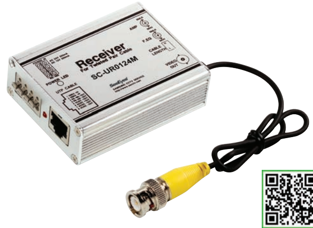
[ SC-UR0124M ]